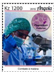
Researcher and Plasmodium malariae